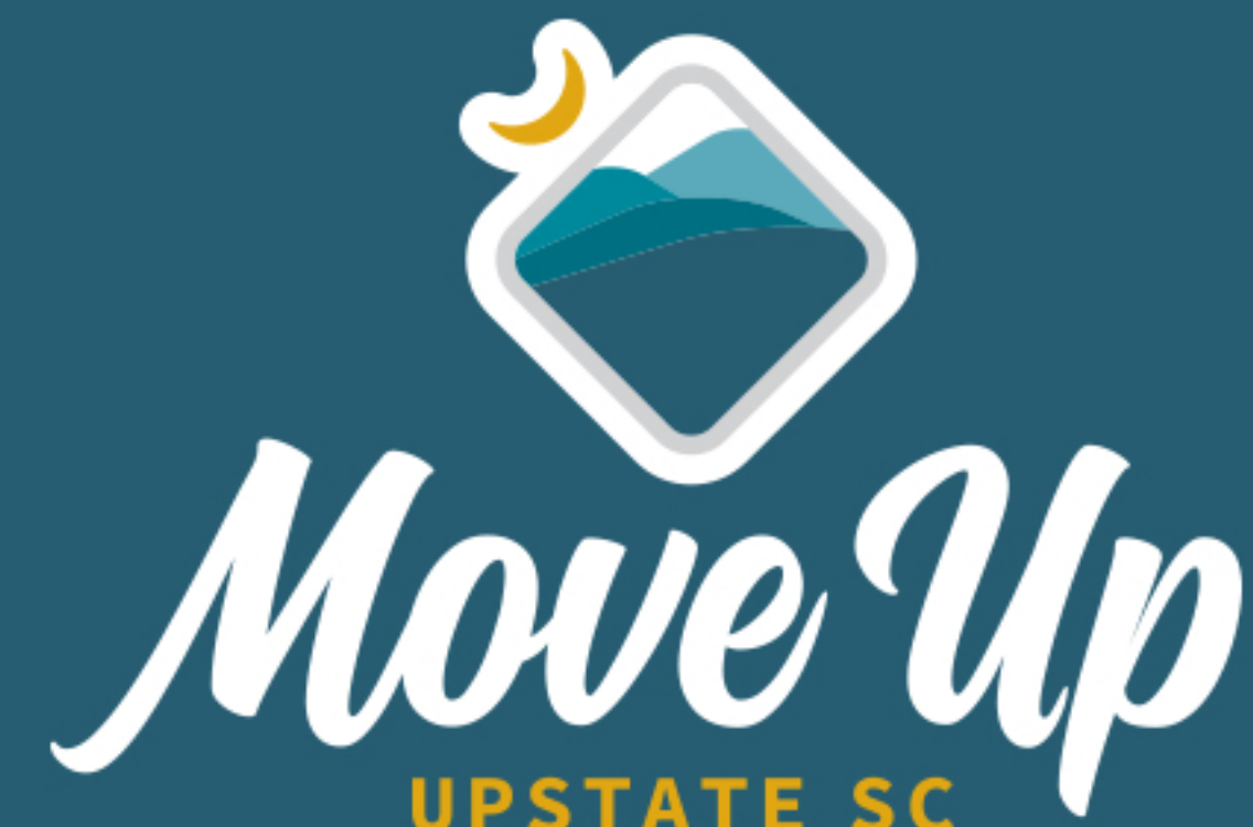
PRIMARY LOGO On Dark Background

This logo is to be used on white or light background colors only.