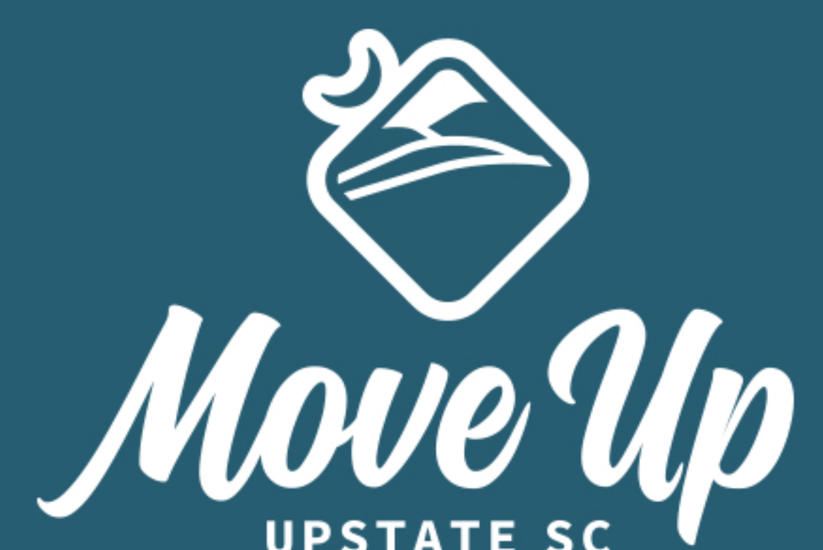
PRIMARY LOGO Single Color on Dark Background

This logo is to be used in cases that require a single color. Only use brand colors.