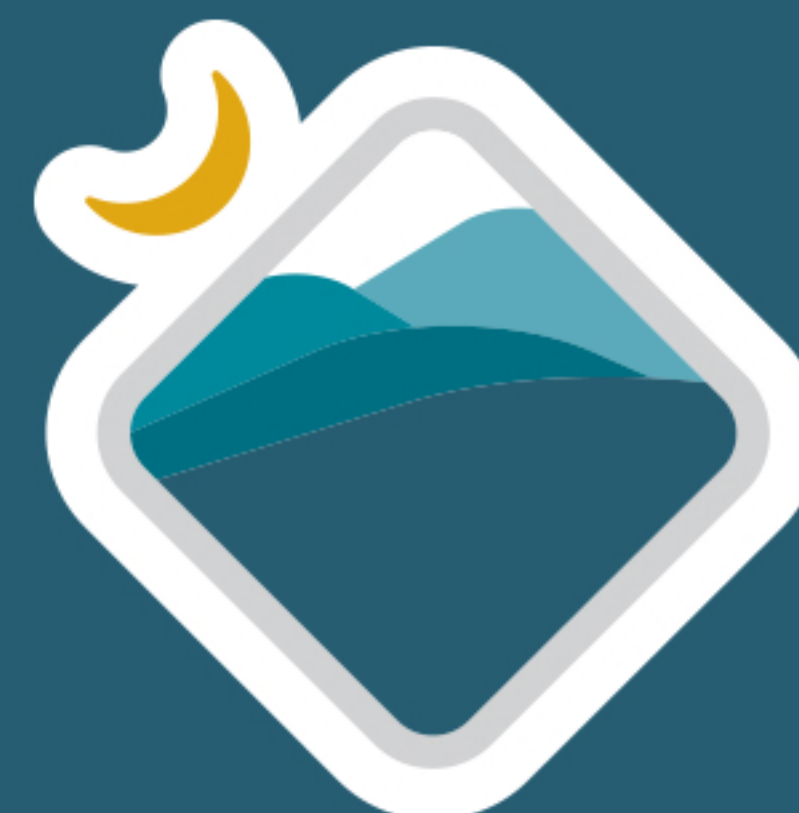
MARK On Dark Background

This mark is to be used on white or light background colors only.