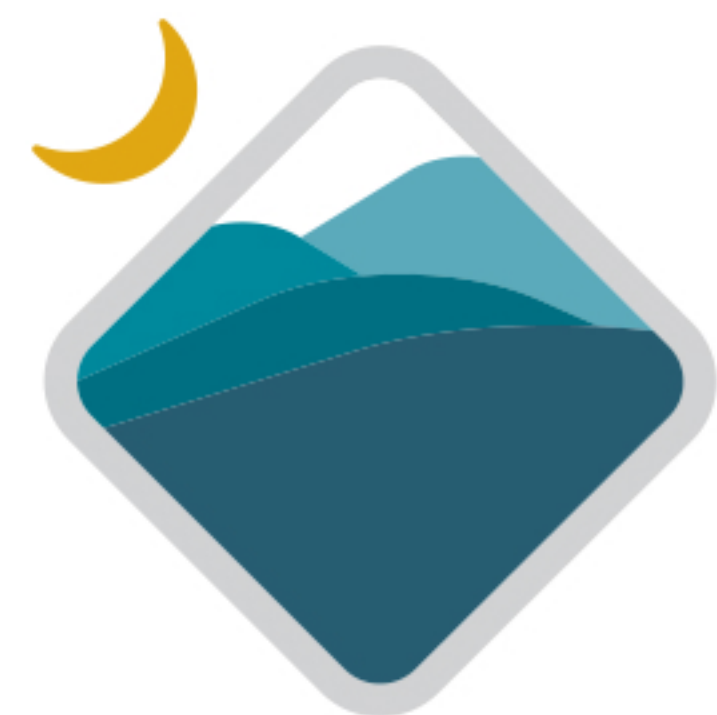
MARK On Light Background

This mark is to be used on white or light background colors only.