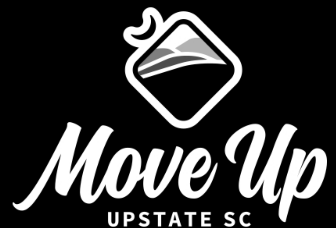
PRIMARY LOGO Grayscale on Dark Background

This logo is to be used in cases where color is not available.