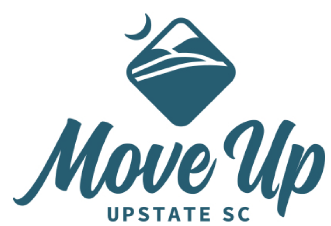
PRIMARY LOGO Single Color

This logo is to be used in cases where color is not available on a black or dark background.