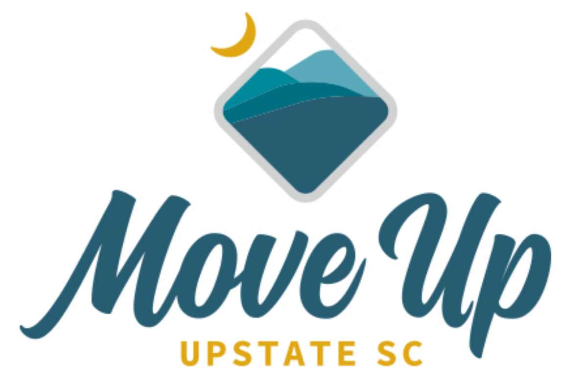
PRIMARY LOGO On Light Background

This logo is to be used on white or light background colors only.