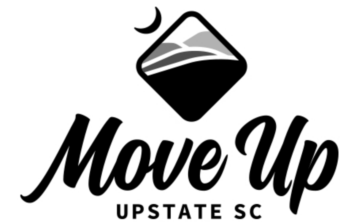
PRIMARY LOGO Grayscale

This logo is to be used on dark backgrounds only.